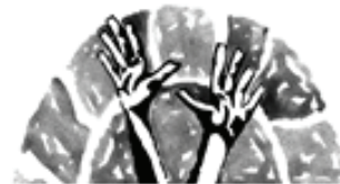
Rejoice in the Lord always. 5th sig

Wednesday, December 16, at St. Joseph's Villa , 1:30 pm